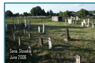
Stones restoration in year 2002

Special thanks to those who built the fence in year 1999